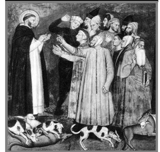
St. Dominic, discussing the Holy Scripture and the Truth with unbelievers.